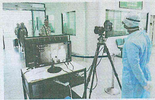
Kawalan terhadap pelancong dan pelajar China dipertingkatkan melalui proses saringan kesihatan menggunakan alat pengimbas haba bagi mengesan penularan Covid-19.

"Jumlah kumulatif kes Covid-19 yang dilaporkan sehingga hari ini kekal sebanyak 22 kes dengan lima kes masih dirawat di wad, manakala 17 yang lain telah pulih dan dibenarkan keluar (wad)," katanya.