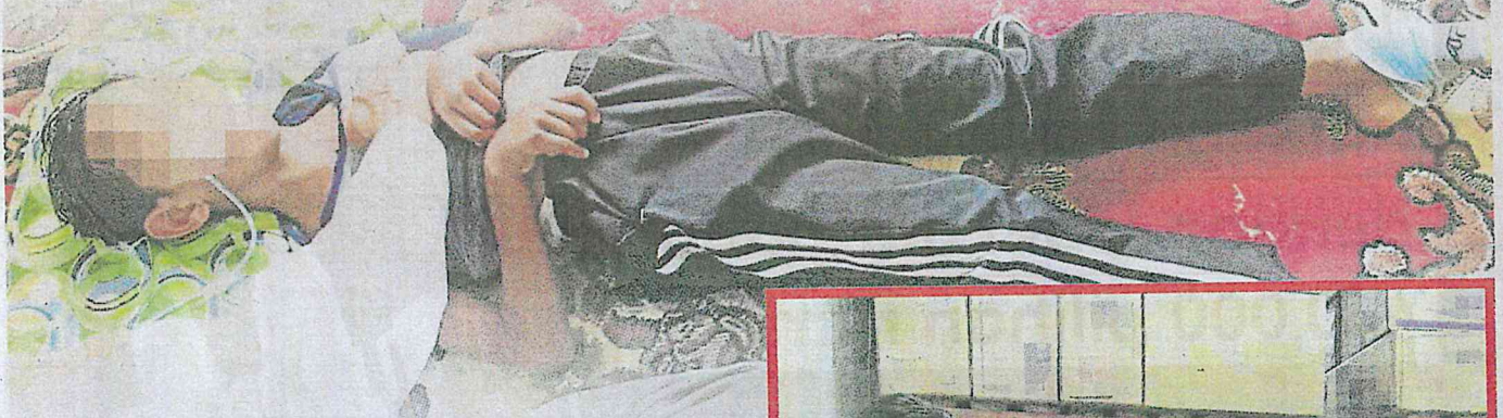
ANTARA remaja didakwa mengalami kesan buruk pada kesihatan selepas makan gula-gula terlarang.

Remaja tersungkur lemah termakan manisan dipromosi gula-gula tenaga