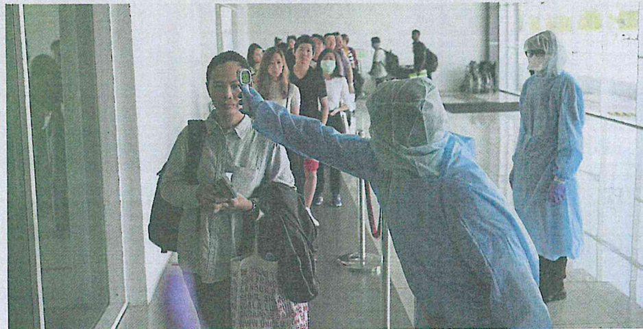
Safety measures: A Kuantan district health officer checking the temperature of visitors flying in from Singapore at the Sultan Ahmad Shah airport arrival gate in Kuantan, Pahang.