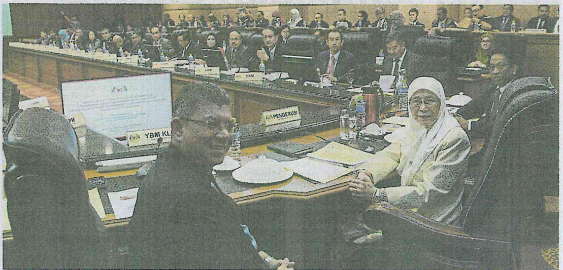
Dr Wan Azizah mempengerusikan Mesyuarat Khas Jawatankuasa Tertinggi, Jawatankuasa Pengurusan Bencana Pusat (JPBP) Kluster Penyakit COVID-19, di Putrajaya, semalam. Turut hadir Menteri Luar, Datuk Saifuddin Abdullah (kiri).

Dr Wan Azizah berkata, walaupun kerajaan mendapati belum ada keperluan mengadakan sekatan terhadap pelancong dari China, saringan kesihatan diper-