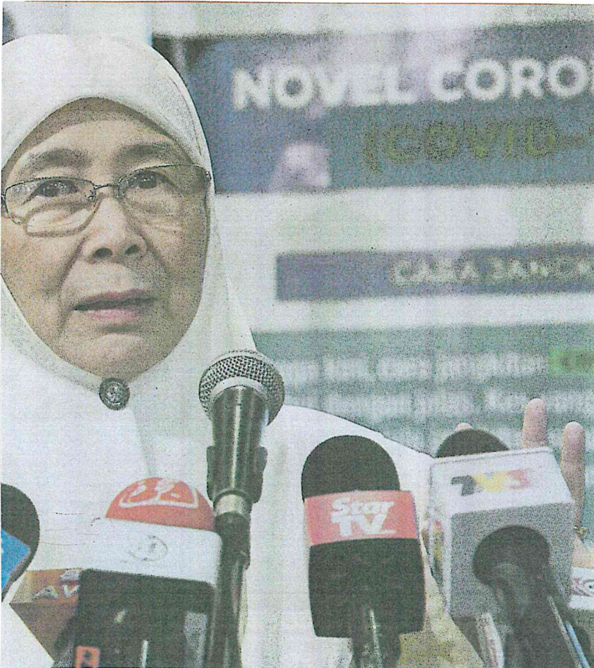
Deputy Prime Minister Datuk Seri Dr Wan Azizah Wan Ismail speaking to the press at the Prime Minister's Department in Putrajaya yesterday.