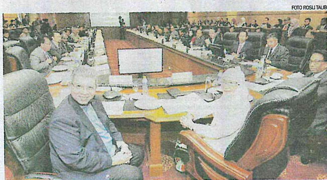
Dr Wan Azizah (kanan) memperkerusi Mesyuarat Tertinggi Jawatankuasa Pengurusan Bencana Pusat Berhubung Covid-19 di Putrajaya semalam.

Mereka yang berada di Wuhan, China telah dikenal pasti untuk dibawa pulang pada Selasa ini