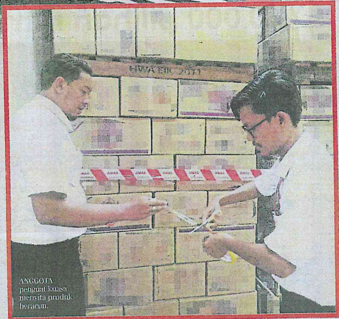
ANGGOTA pengunit kuasa menyita produk beracun.

mendapati tiga produk gula-gula itu diimport tiga syarikat berbeza terletak di Alor Setar, Kedah; Chemor, Perak dan Cheras Selatan, Kuala Lumpur.