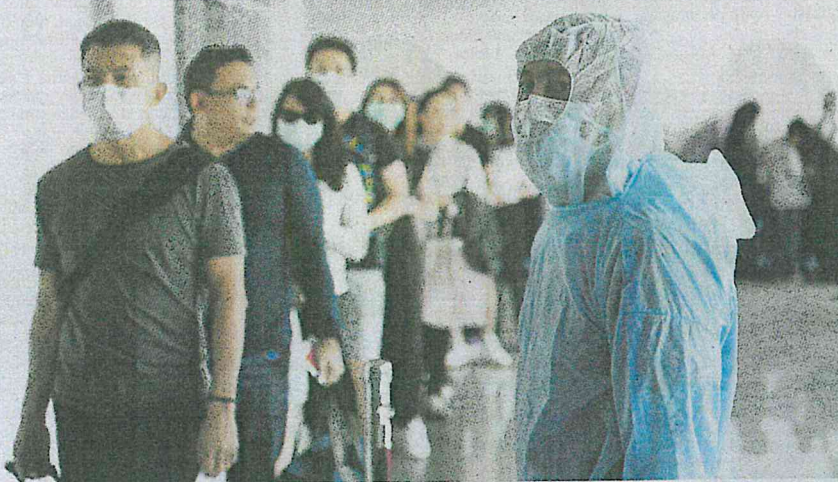
* PETUGAS Kesihatan Daerah Kuantan melakukan proses saringan ke atas penumpang penerbangan Singapura-Kuantan yang tiba di terminal Lapangan Terbang Sultan Ahmad Shah (LTSAS), semalam.